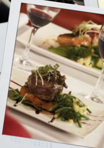
quality that shows