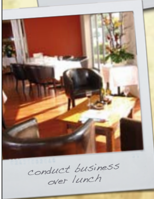
conduct business over lunch