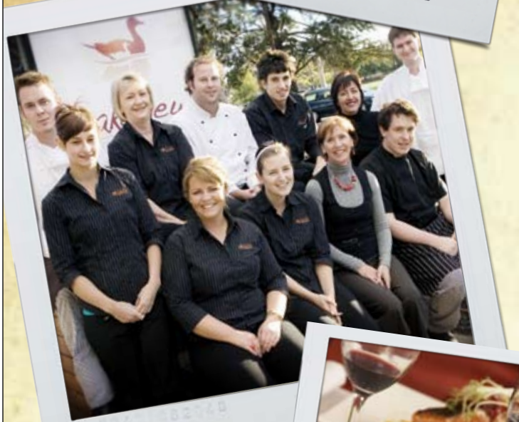
the team that makes it happen