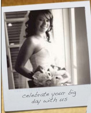
celebrate your big day with us